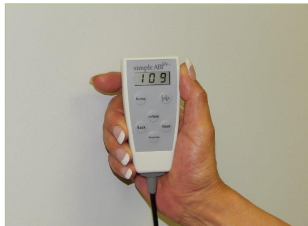
Cuff-Link Remote - 6 button simplicity!